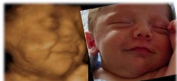
Just before & after birth!