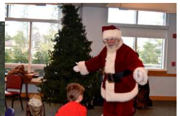
Little Church School— during the Sunday 9 am Mass. Parish Life Center.