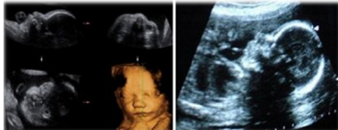
At 32 weeks