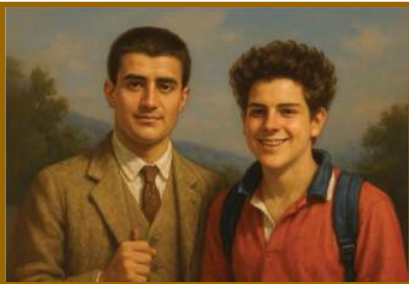
Saint Pier Giorgio Frassati | Saint Carlo Acutis