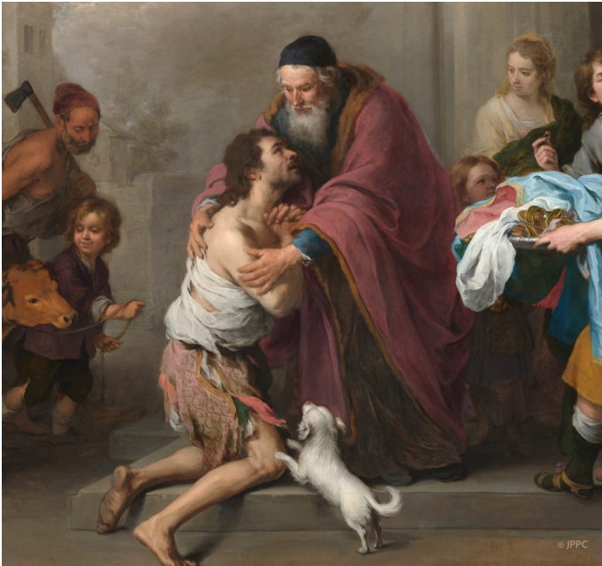
"He was lost and has been found." Luke 15:32