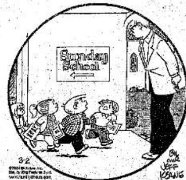
"Today we learned about the Top Ten Commandments."

When: Saturday, Oct. 12, 9AM-3PM Sunday, Oct 13, 8:30AM-1:30PM