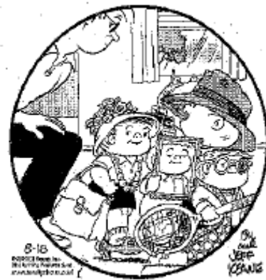
"Mommy's cleaning out the attic."

The following aren't saleable at our garage sale: old TV's (only flat screens), VCR's, console stereos, air conditioners, sofas, large cabinet furniture, mattresses, shoes, text books, encyclopedias, children's car seats (unless brand new and up to code), stuffed animals and baskets.