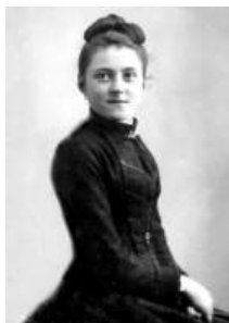
St. Thérèse of Lisieux at 15.