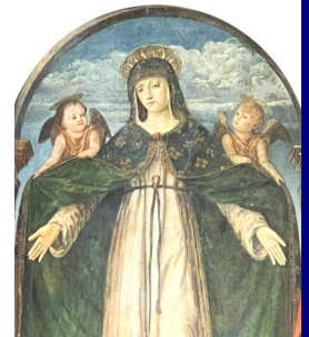
Madonna, Mother of the Church

Remember, O most gracious Virgin Mary, That never was it known that anyone that Fled to your protection, implored your help, Or sought your intercession was left unaided. Inspired with this confidence, I fly unto you, O Virgin of virgins, my Mother; to you I come, Before you I stand, sinful and sorrowful; O Mother of the Word Incarnate, despise not my petitions, But in your mercy hear and answer me. Amen.