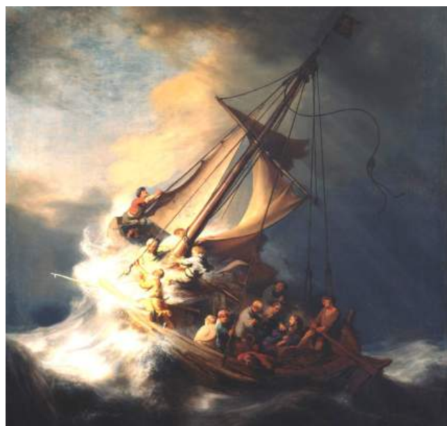
"Quiet! Be Still!" Mark 4:39