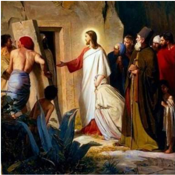
“Lazarus, come out!” Jn 11:43