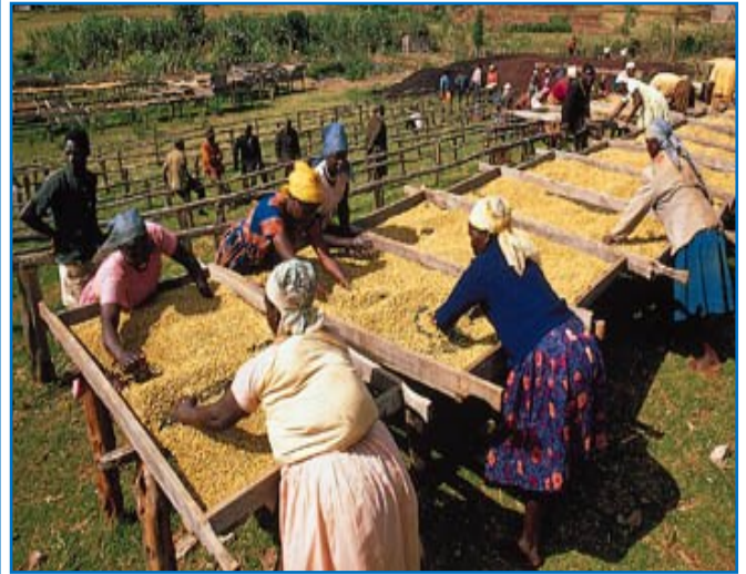
Cooperative workers drying coffee on racks, Nyeri, Kenya.

Your response was overwhelming! The amount collected was $13,086. Father Gabriel Muteru is so grateful for the opportunity to speak at all the Masses and for your generous contributions. All the donations will be used to give the people access to clean water and also purchase vehicles for the priests, doctors and nurses to reach people living in remote areas.